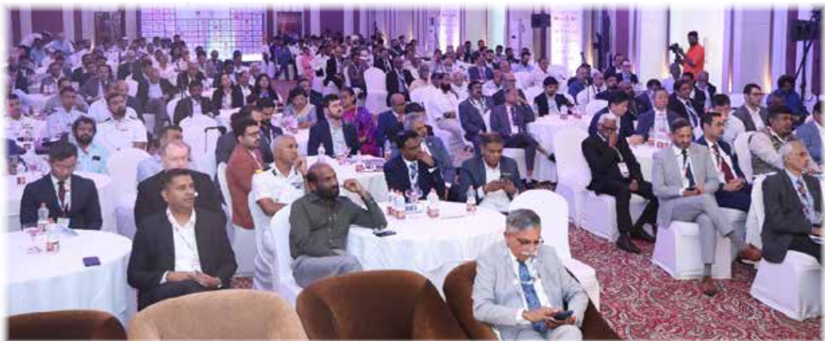
The Shipping and Marine Fraternity in strong presence at COMARSEM