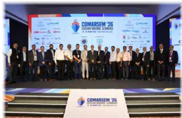
Group of Sponsors and Participants