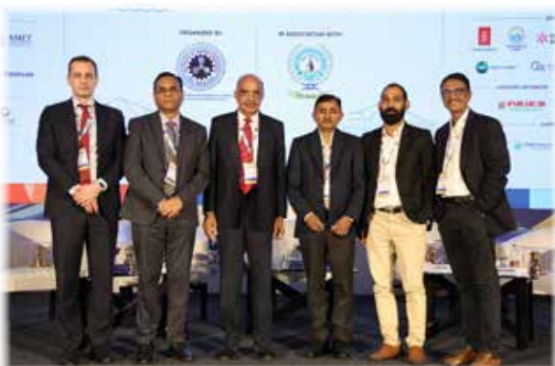
Paper Lot-2 Presenters