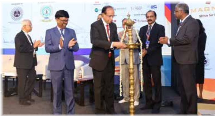
Lamp lighting ceremony by the dignitaries