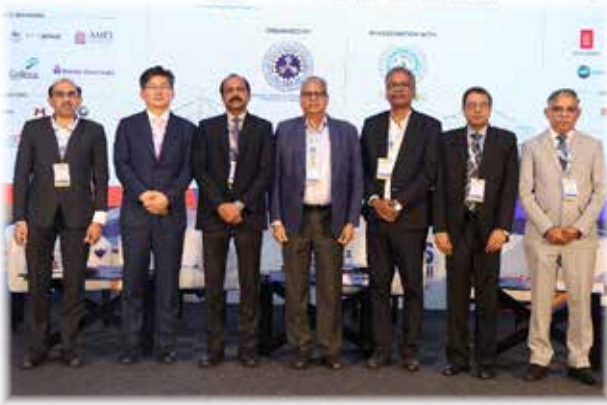
Panel 1: Speakers