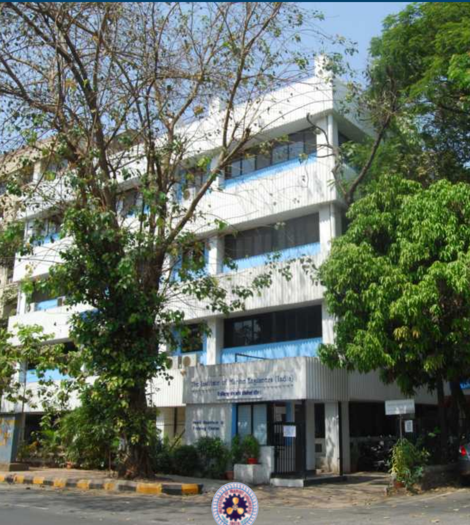
IME(I) House, Nerul, Navi Mumbai